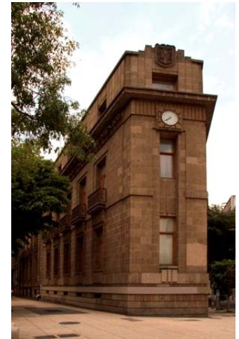
Mexico City National Chamber of Commerce

These services will be provided by our Chamber without cost to your members or your organization, facilitating and complementing your services for welfare of your companies.